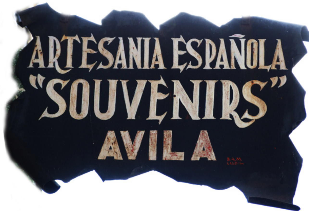
Examples of typical Spanish urban lettering. Avila and Toledo.